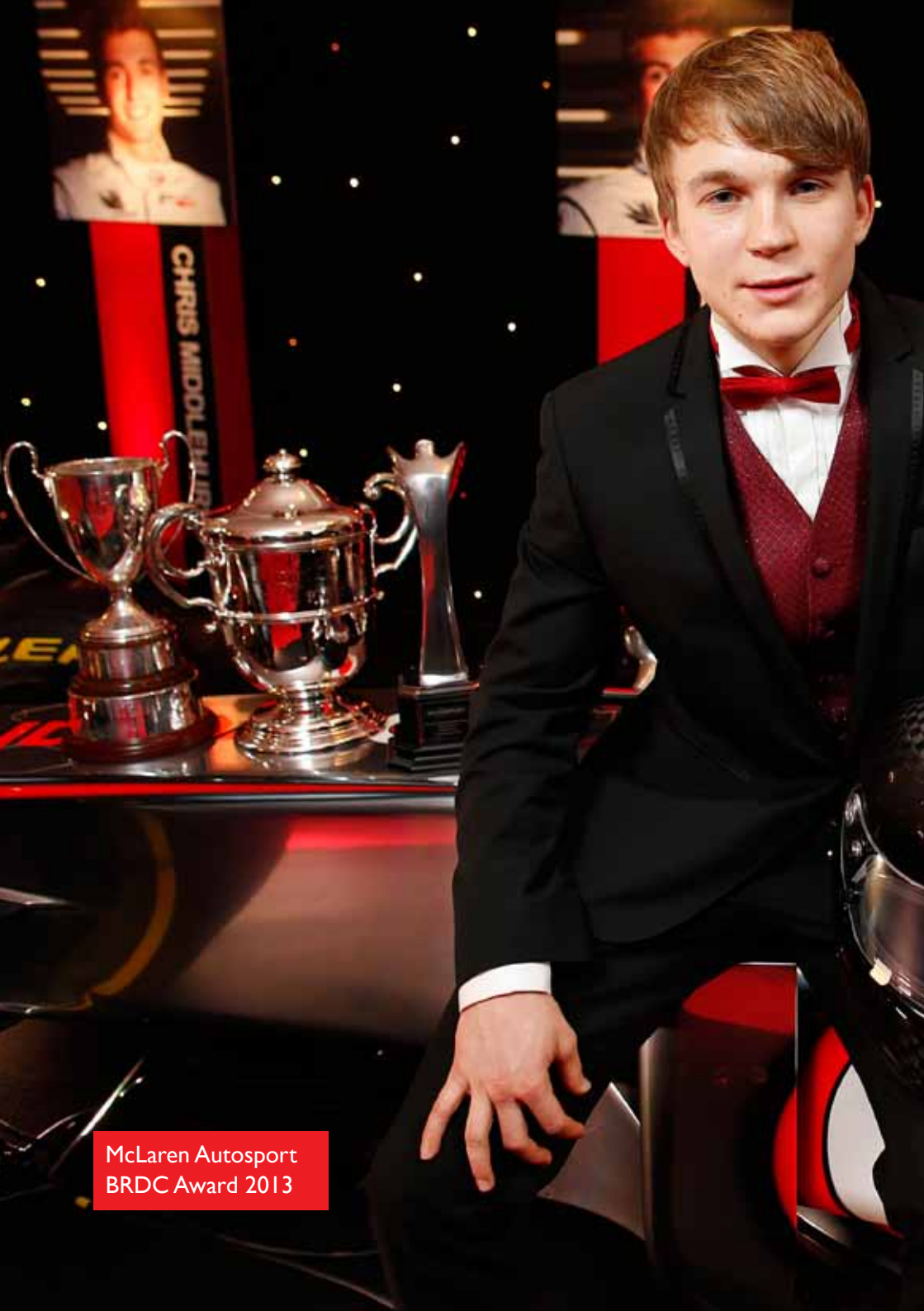
McLaren Autosport BRDC Award 2013